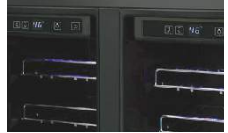
DUAL TEMPERATURE ZONES