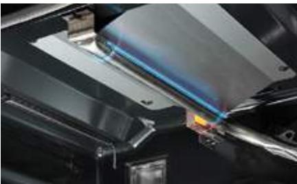
EVEN HEAT BROILER