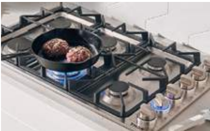
4 -W 6 HIGH-INTENSITY BURNERS