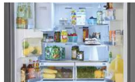
SHOWCASE LED LIGHTING