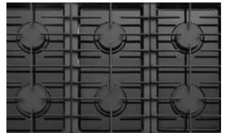
PORCELAIN SPILL TRAY