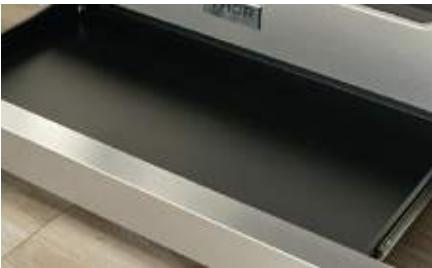
STORAGE SPACE (L SERIES)