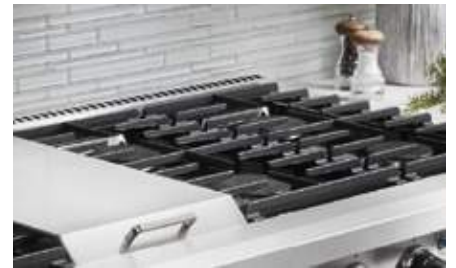
CONTINUOUS COOKING GRATES