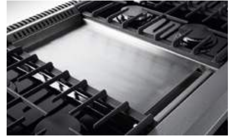
GRIDDLE FEATURE (48 INCH ONLY)