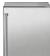
MULTIPLE DESIGN OPTIONS