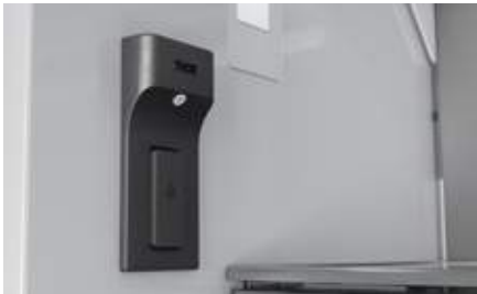
INTERIOR WATER DISPENSER