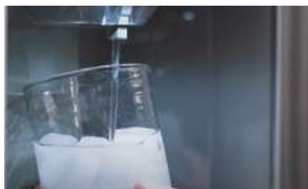
WATER FILTRATION (TRF3601FD ONLY)