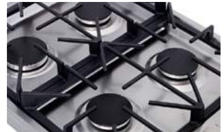
CONTINUOUS COOKING GRATES