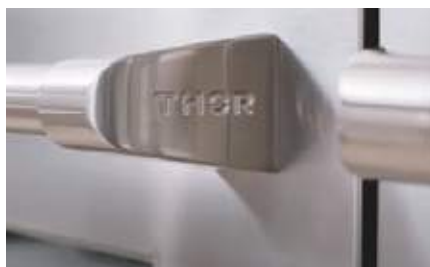
STAINLESS STEEL EXTERIOR