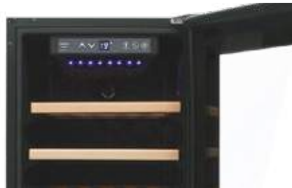
CHARCOAL FILTRATION SYSTEM