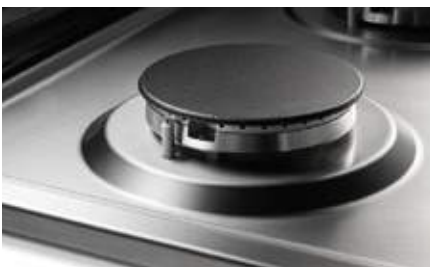
AUTOMATIC ELECTRIC IGNITION