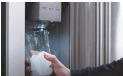
ICE & WATER DISPENSER