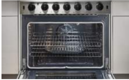
LARGE OVEN CAPACITY