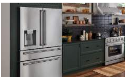
ENERGY STAR CERTIFIED