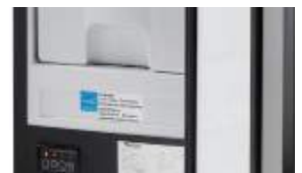
ENERGY STAR CERTIFIED