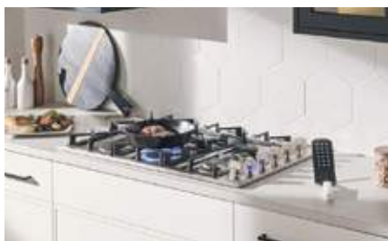
LIQUID PROPANE OPTION