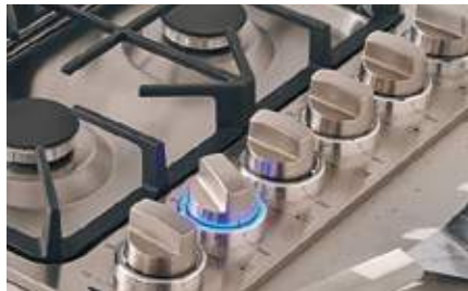
PROFESSIONAL ILLUMINATED KNOBS