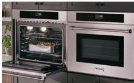
MULTIPLE CONVECTION MODES