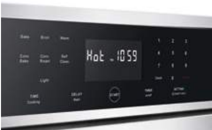
TOUCH GLASS CONTROL PANEL