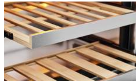
WOODEN OR WIRE SHELVES