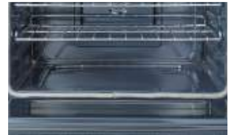
HIDDEN BAKE ELEMENT