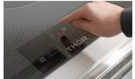
TOUCH GLASS CONTROLS