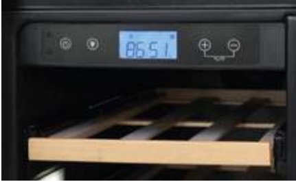
PRECISE TEMPERATURE CONTROL