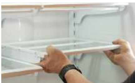
ADJUSTABLE RACKS & SHELVES