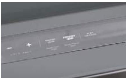
TRIPLE OR DUAL-TECH COOLING SYSTEM