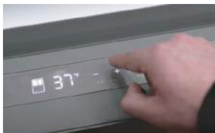
SUPER FREEZING AND COOLING