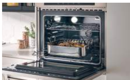
LARGE OVEN CAPACITY