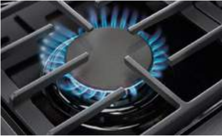
HIGH-POWERED BTU BURNERS