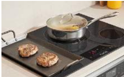
4 - 5 RADIANT ELEMENTS