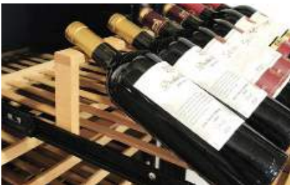
BOTTLES AND CANS