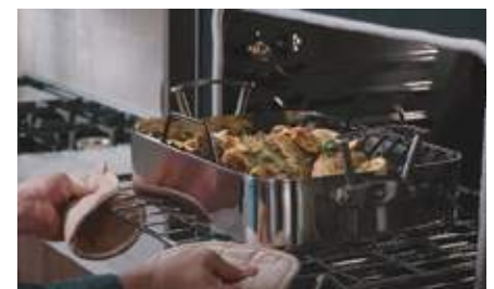
POWER & CONTROL