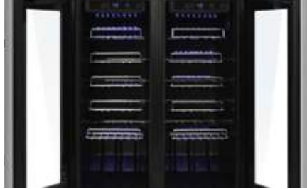
LARGE STORAGE CAPACITY